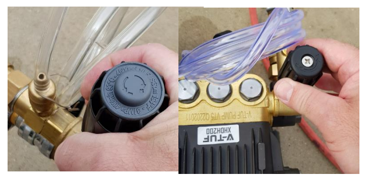
Fig2: Pressure adjustment knob (these may differ in looks) – turn anticlockwise (to low pressure) for starting. This will make it easier to start and also reduce unnecessary wear on your engine pull start mechanism.

When the engine has started turn the pressure adjuster clockwise to increase pressure to suite the task you are undertaking.