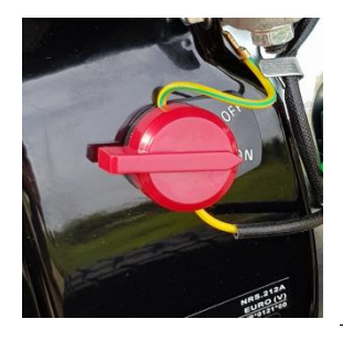
Fig1: Engine on – off switch:

Must be on when starting and switch to off position to stop motor