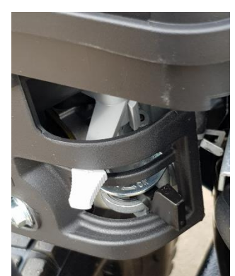
Fig4: Engine Fuel tap lever (black) and choke lever (grey)

The image shows the high-pressure hose disconnected and a jet of water jetting out. This is normally done when priming (getting the air out and water in) the pump when the machine is used on suction. Run the engine until you get a strong stream of water jetting out, then stop the engine and connect the high-pressure hose, then restart with the pressure adjustment knob set on low pressure.