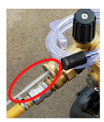
Fig3: High pressure outlet : This is where the high-pressure hose connects.

When the engine has started turn the pressure adjuster clockwise to increase pressure to suite the task you are undertaking.