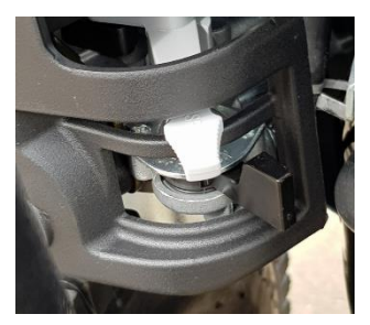
Fig5: Warm start or trouble start position - Engine Fuel tap lever (black) to the right and choke lever (grey) in centre position. Don't forget to move this choke lever immediately to the right (off position) when the engine starts running

The figure shown is the starting position before pulling the pull cord when the engine is cold. Black lever to the right (on position) – this stays in this position throughout the operation; Grey lever to the left (on position) – this choke lever is moved immediately to the right (off position) when the engine starts running.